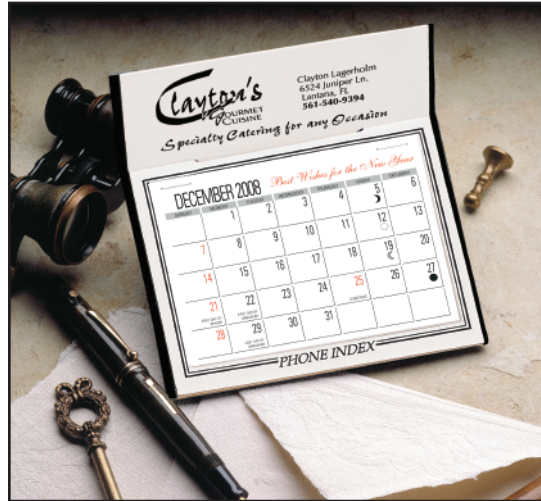
At midnight on Dec. 31st, prime desk space becomes available. Give your client command of that space!

Every December 31st, the IDEAL advertising space becomes available. It is not a billboard, newspaper or magazine. It is the space on a customer's desk or wall that houses their calendar. Give your clients the opportunity to claim that prime space so they can keep their name and product offerings in front of current and prospective customers all year long.